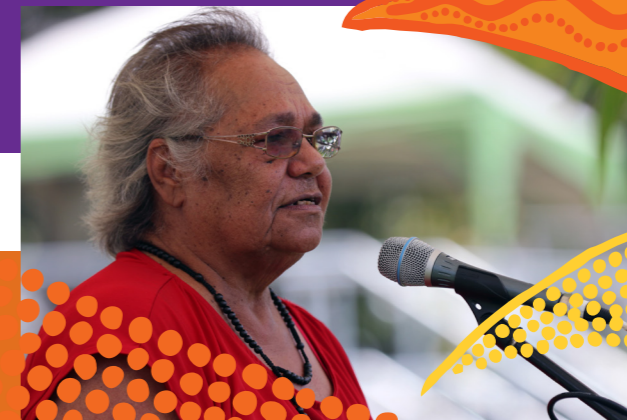
Above: Rosalie Kunoth-Monks