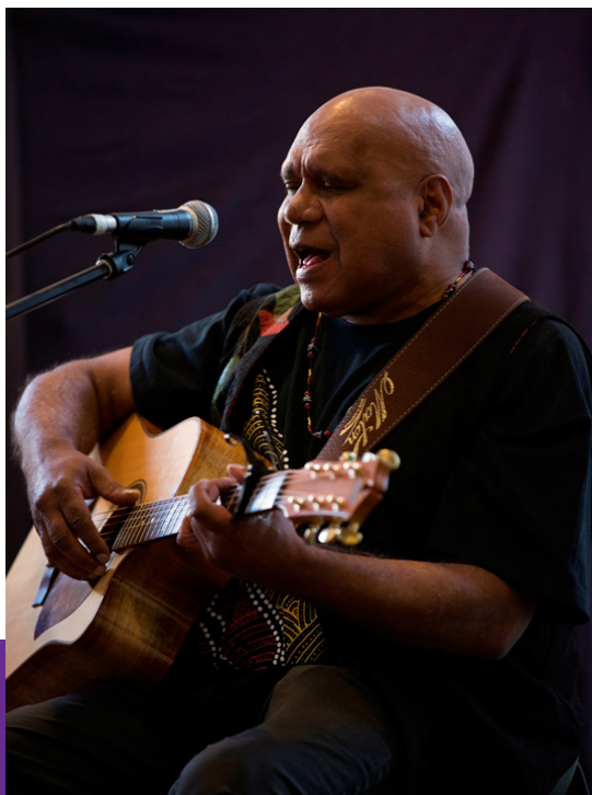
Above: A moving performance by Archie Roach Right: Watching the collective healing video