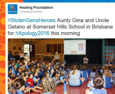
LEFT TO RIGHT: NSW – Wanaruah Local Aboriginal Land Council, Muswellbrook; South Australia – Circle of Hope, Adelaide; ACT – Relationships Australia Canberra; Queensland – Somerset Hills P & C, Brisbane