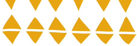
Figure 1: Issues causing disharmony and imbalance