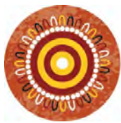
Nunkuwarnin Yunti of South Australia Inc.