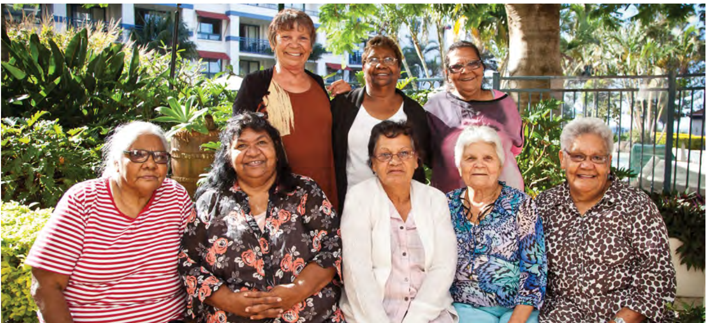
Coota Girls gathering, November 2013

The system used to forcibly remove Aboriginal children in New South Wales was established under the Aborigines Protection Act 1909-1969 and consisted of the Aborigines Protection Board 1909-1939, the Aborigines Welfare Board 1940-1969 and the Children’s Training Homes constituted under the Act: the Cootamundra Domestic Training Home for Aboriginal Girls 1912-1969 and the Kinchela Aboriginal Boys Home 1924-1969. For sixty years the methods used to forcibly remove Aboriginal children in NSW did not change: children were removed from their parents to be trained and indentured as domestic servants and farmhands for wealthy non-Aboriginal households and farms. This system operated in parallel to the NSW Child Welfare system in NSW until it was dismantled by the Aborigines Act in 1969.