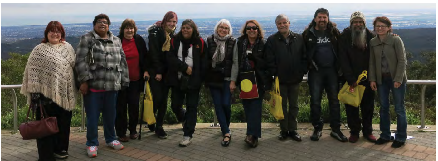
Reunion to Self participants at Mt Lofty Summit

Reunion to Self enables healing for these people through a series of six day trips and an overnight camp. The program aims to reduce isolation and distress and develop sustainable relationships with peers and with local places of cultural significance and the communities and stories connected to those places. Clients learn to overcome the effects of trauma and grief in their lives through increased self-awareness, emotional support, cultural immersion and involvement in healing activities. The program strengthens cultural identity and draws upon the dreaming story of Tjilbruke whose trail they follow throughout the program.