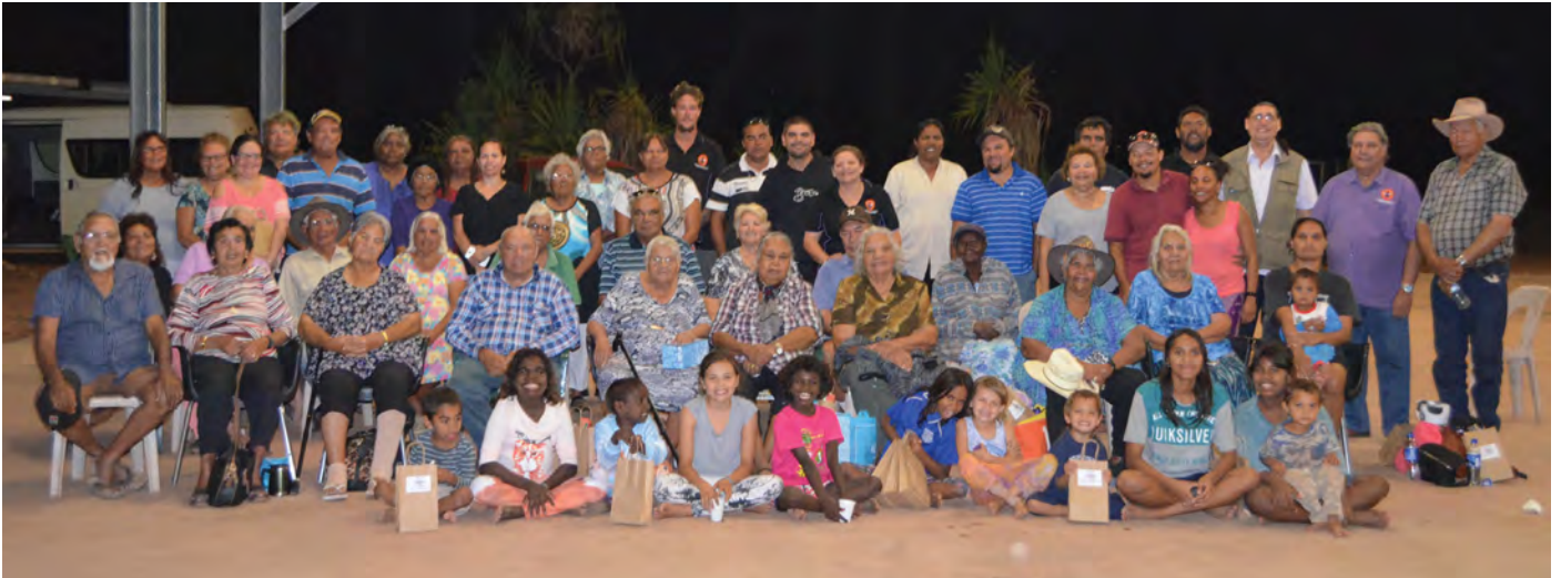
Sixty Stolen Generations members from across the Kimberley region came together with their families at Wuggubun, June 2015

WARNING: Aboriginal and Torres Strait Islander people are warned that the following photos may contain images of deceased persons