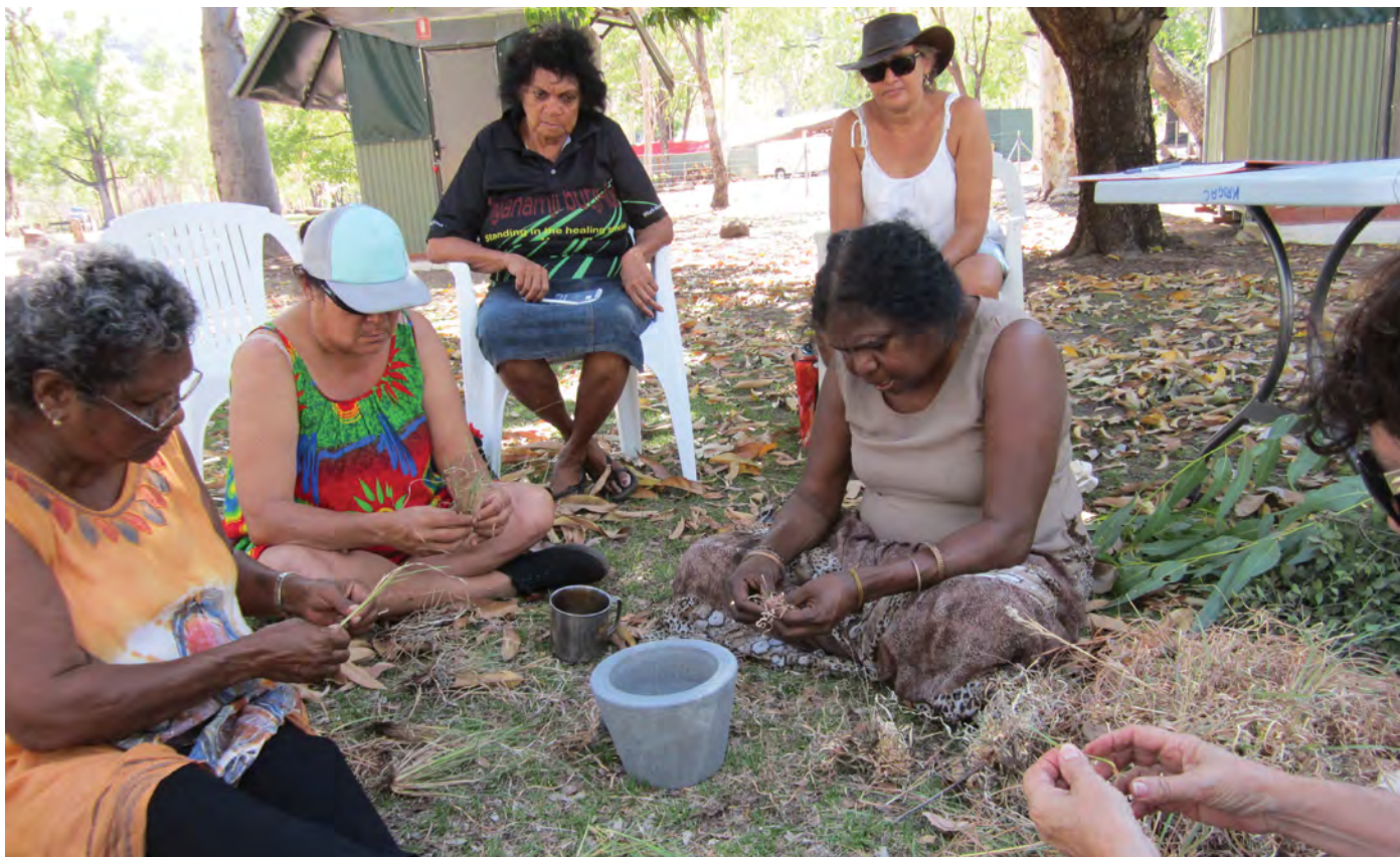
Katherine Region Stolen Generation Aboriginal Corporation

“Our projects have taken us on a journey of healing and stories of hope.”