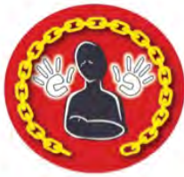
Kimberley Stolen Generation Aboriginal Corporation