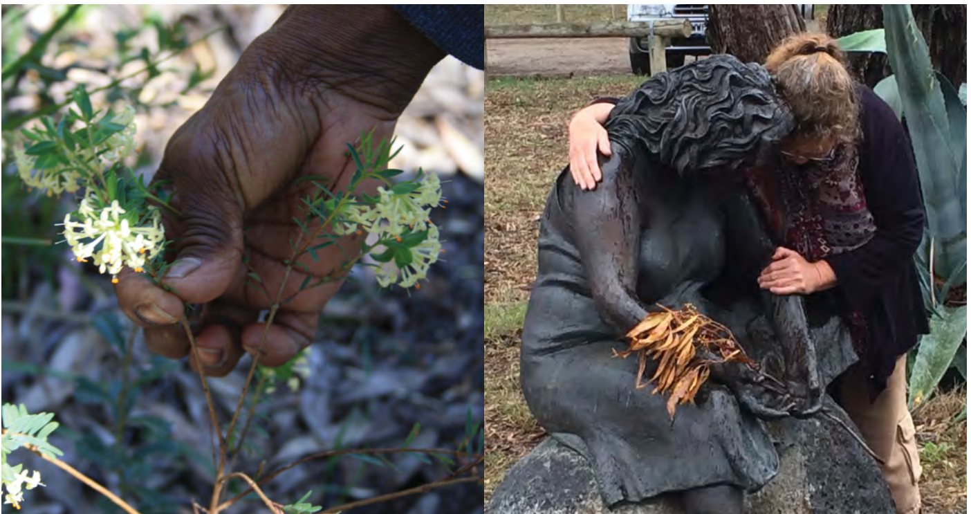
Reunion to Self project