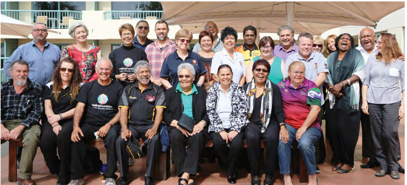
Stolen Generations members, organisations and services at a collective healing gathering, September 2015