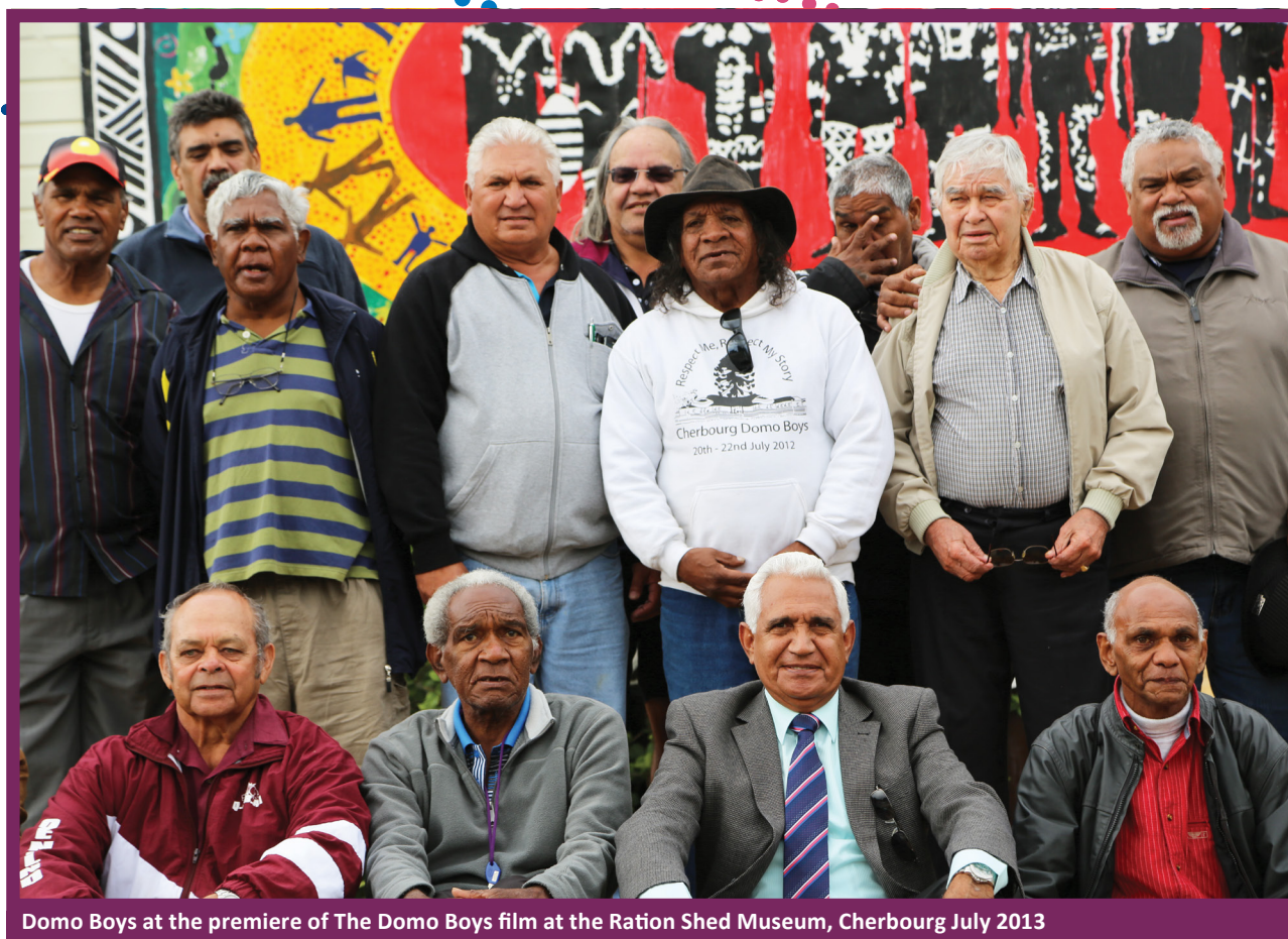
Domo Boys at the premiere of The Domo Boys film at the Ration Shed Museum, Cherbourg July 2013